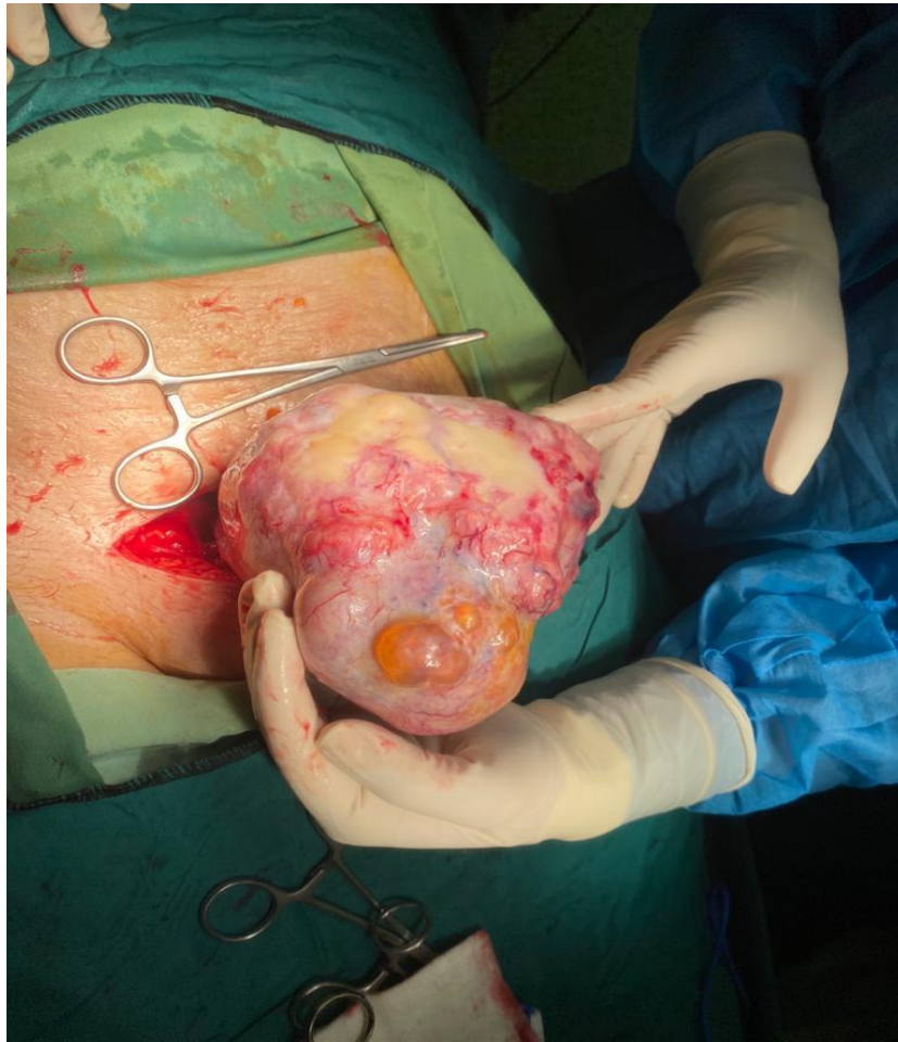
Figure 1. Irregular-shaped mass containing multiple cysts and adipose tissue