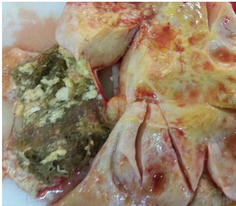
Figure 2. Admixture of sebum, hair within cavity of ovarian mass